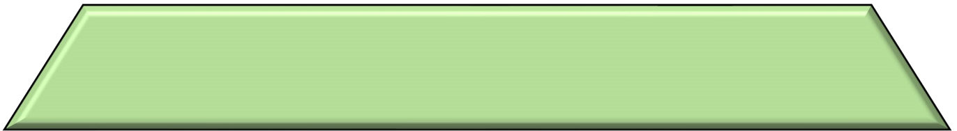
Figure 2-2: Hierarchy Structure